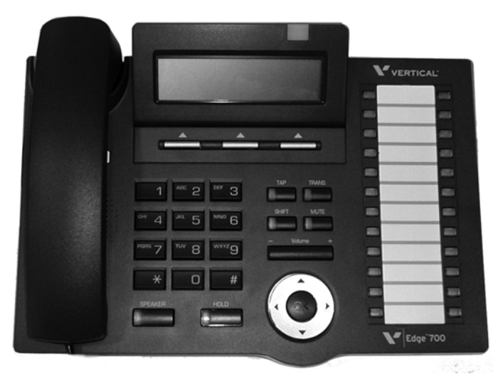
Edge 700 (digital)

8/24-Button Keysets 3 Soft Keys Message Waiting Light Programmable Keys FIXED BUTTONS: Hold